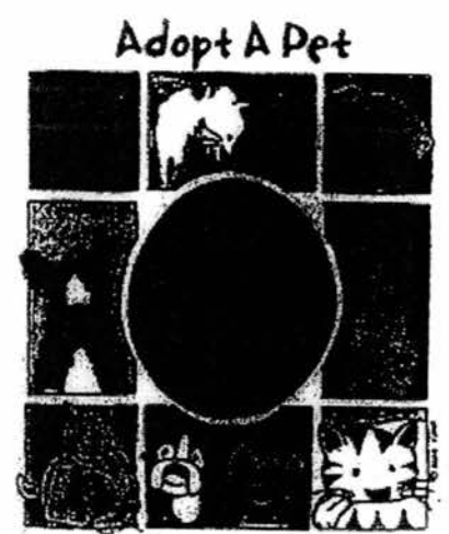
rus love makes the world go round!

Pets are being abandoned every day. Animal shelters and animal welfare groups have their hands full trying to manage not only the many cases that are reported but also those that they encounter by chance.